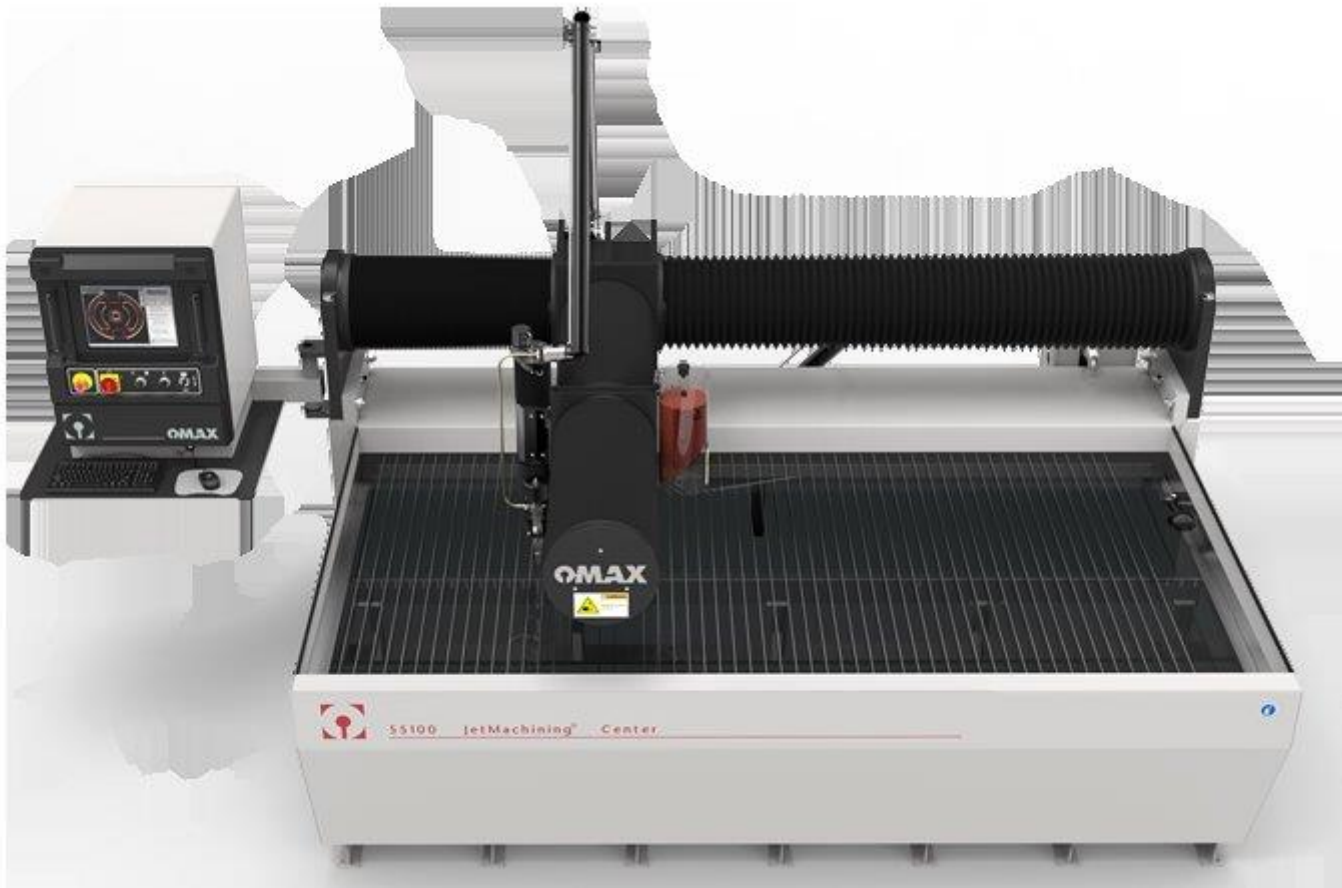
Figure 1. – Waterjet System